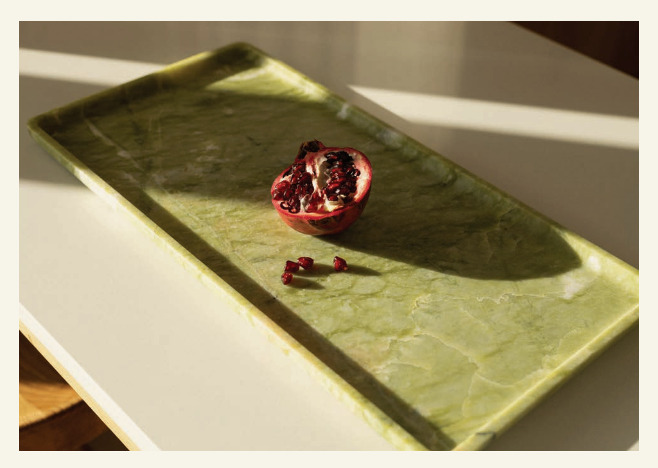
Square Tray Ming Green