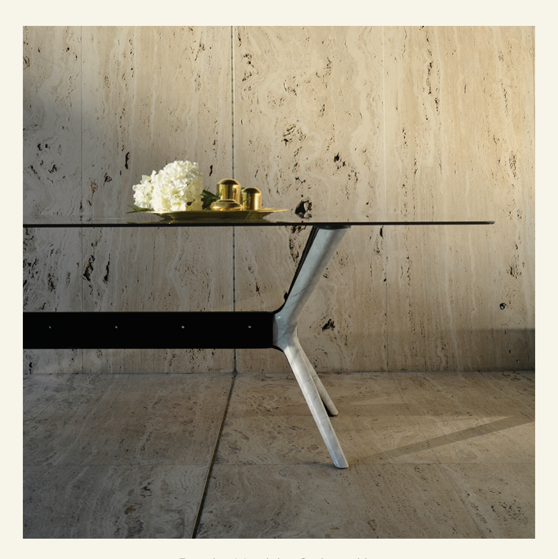
Roots Marble Calacatta