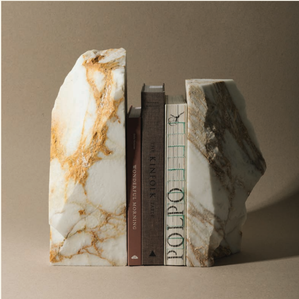
Raw Calacatta Oro