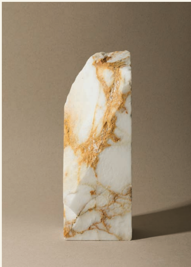
Raw Calacatta Oro 1