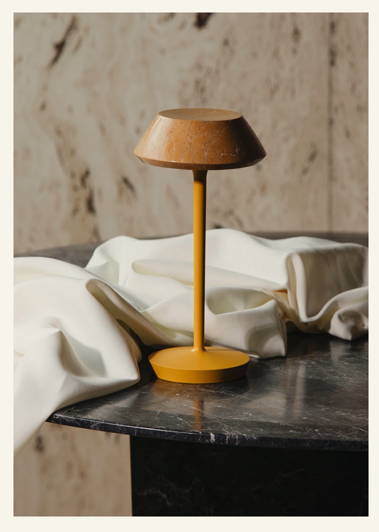
mini FIORE Yellow