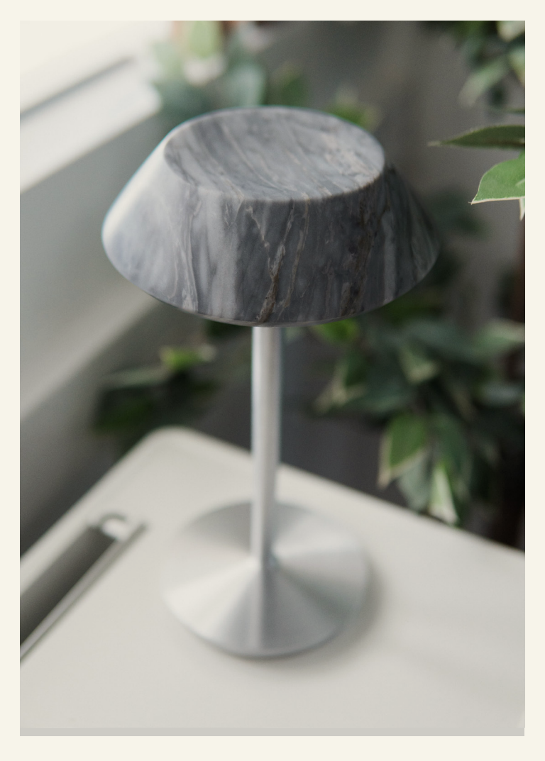
mini FIORE Grey