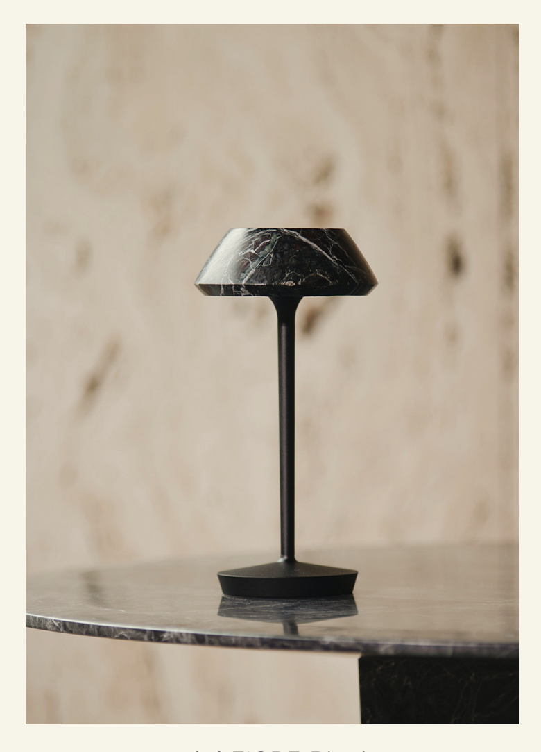
mini FIORE Black