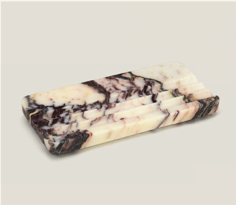
Lithos Calacatta Viola