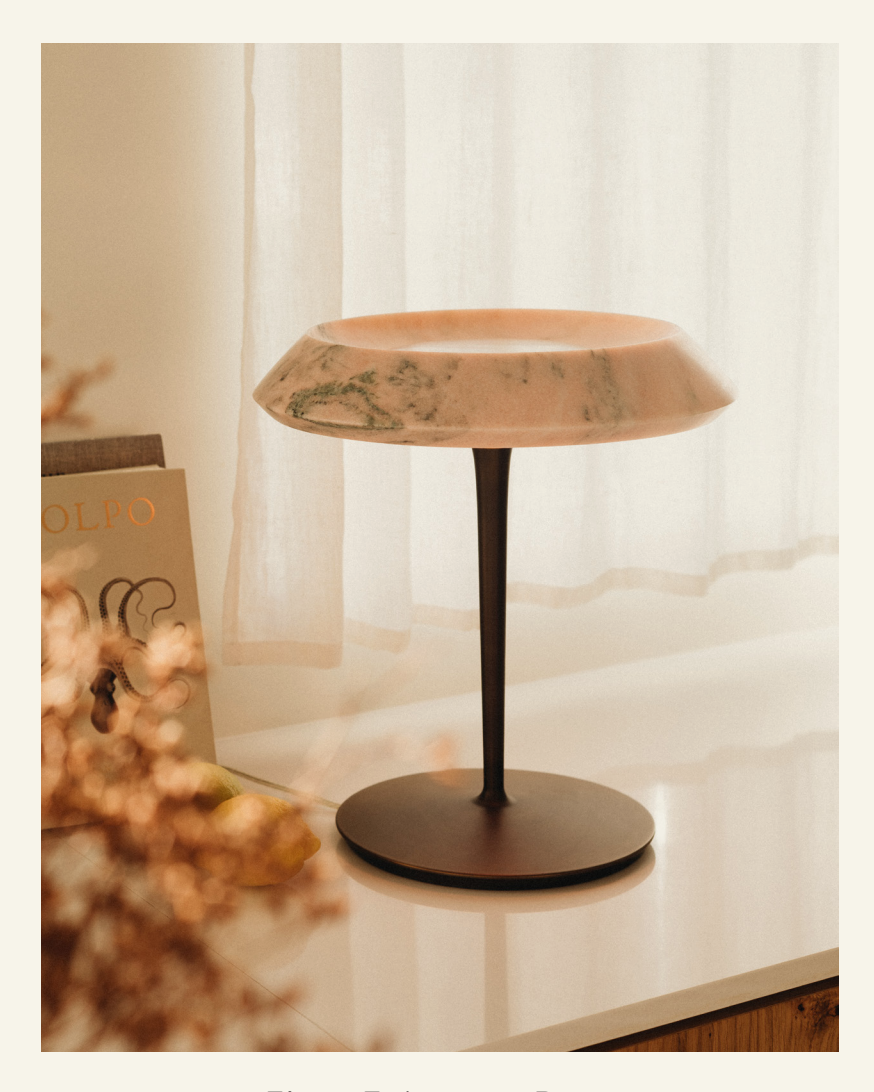
Fiore Estremoz Rosa