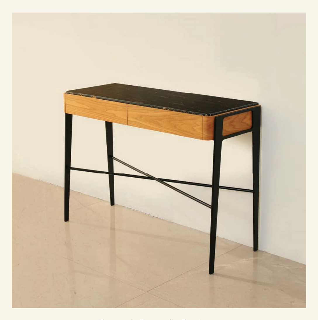
Bouvet Console Portoro